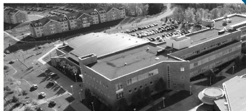
Pictured: The College's three new residence halls (left background), the Whitney Applied Technology Center (center) and the Gordon Student Center (right background).